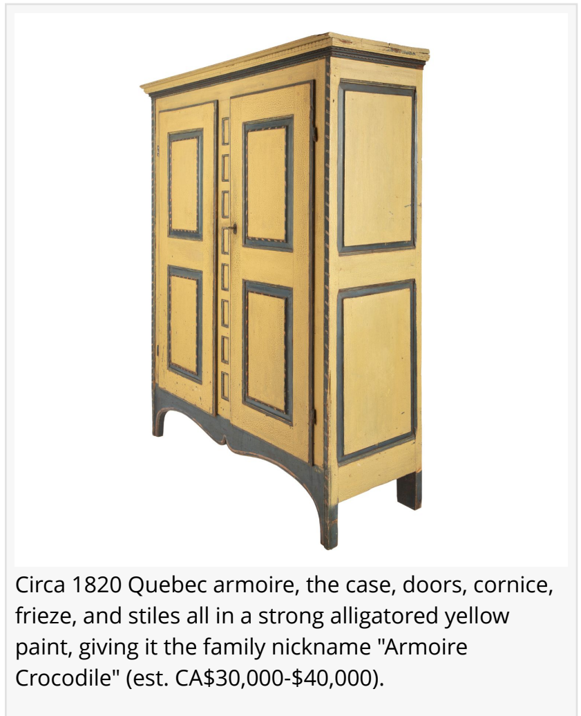
Circa 1820 Quebec armoire, the case, doors, cornice, frieze, and stiles all in a strong alligatored yellow paint, giving it the family nickname "Armoire Crocodile" (est. CA$30,000-$40,000).

The other is a Quebec armoire in exceptional polychrome paint (est. $30,000-$40,000). The case, doors, cornice, frieze, and stiles are in a strong alligatored yellow paint, giving it the family nickname "Armoire Crocodile". The yellow is in dramatic contrast with the deep blue found on the moldings, panel edges and lower rail. The left side is in the original untouched blue paint.