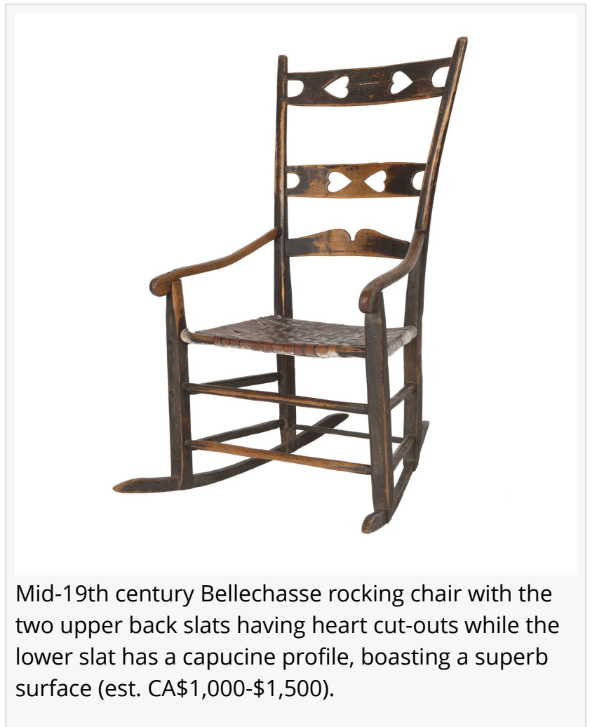
Mid-19th century Bellechasse rocking chair with the two upper back slats having heart cut-outs while the lower slat has a capucine profile, boasting a superb surface (est. CA$1,000-$1,500).

Here is an online link to the auction: https://live.millerandmillerauctions.com/auctions/4-8X3LNV/the-jean-marc-danielle-belzile-collection .