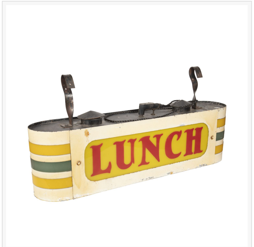
Circa 1930-1959 Quebec double-sided Art Deco restaurant sign in metal and plastic with blue and yellow bands at the curved ends, red lettering on a yellow ground (est. CA$1,000-$1,500).

This press release can be viewed online at: https://www.einpresswire.com/article/631170843 EIN Presswire's priority is source transparency. We do not allow opaque clients, and our editors try to be careful about weeding out false and misleading content. As a user, if you see something we have missed, please do bring it to our attention. Your help is welcome. EIN Presswire, Everyone's Internet News Presswire™, tries to define some of the boundaries that are reasonable in today's world. Please see our Editorial Guidelines for more information. © 1995-2023 Newsmatics Inc. All Right Reserved.