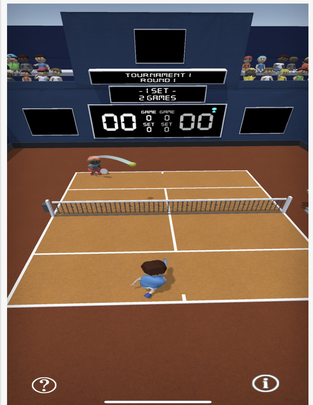
Competitive Tennis Challenge Screenshot