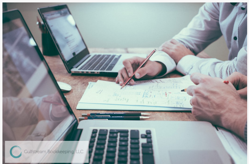
Business Payroll Services - Stuart