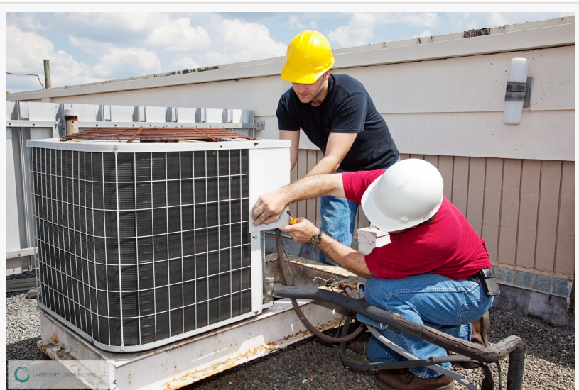
Bookkeeping for Air Conditioning and HVAC Businesses