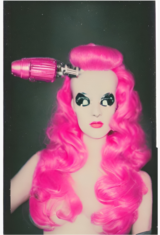
love machine photographic series

This press release can be viewed online at: https://www.einpresswire.com/article/631185499