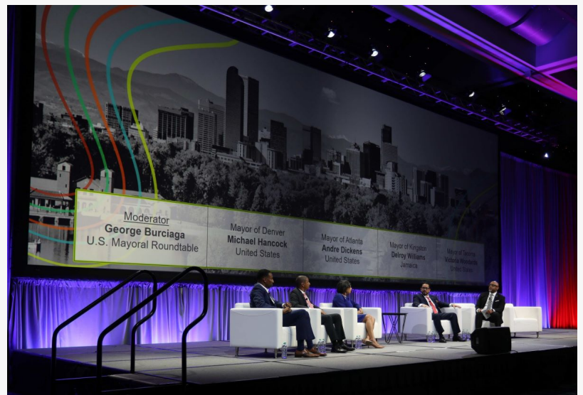
US Roundtable at Cities Summit of the Americas

communities in a changing world. I'm pleased to host the US Mayoral Roundtable and have the opportunity to talk with other city leaders about innovative strategies to move our cities forward.”