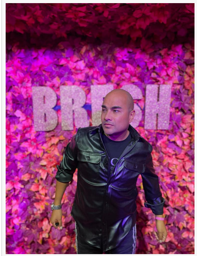
Always Diego is a reference in trends and fashion