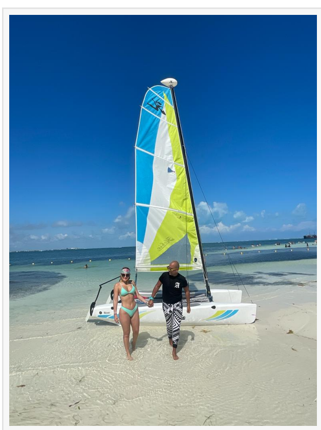
His lifestyle journalism and influencer status has allowing him to work for the most renowned Brands in Mexico.