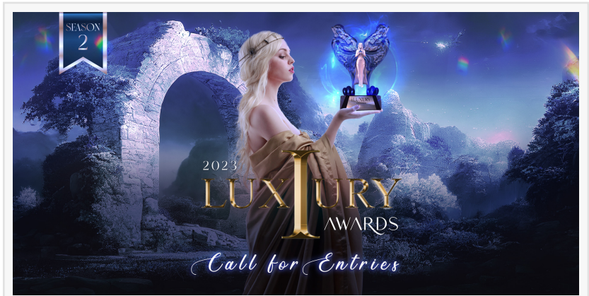
2023 iLuxury Awards Season 2 Call for Entries