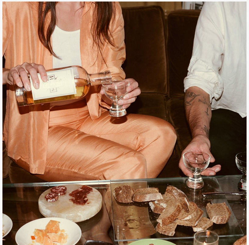
Basbas Premium Hierbas at the Dinner Party

MIAMI, FLORIDA, USA, May 2, 2023 /EINPresswire.com/ -- Basbas , the leading lower-ABV herbal spirit, announced today the formal launch of its $2M equity raise following a successful partnership with the International Music Summit. International Music Summit is the leading electronic music industry conference. The funds raised will be used to continue fueling Basbas' tremendous recent growth and expand the brand's reach in key markets including Miami, New York, Los Angeles, London, and Ibiza.