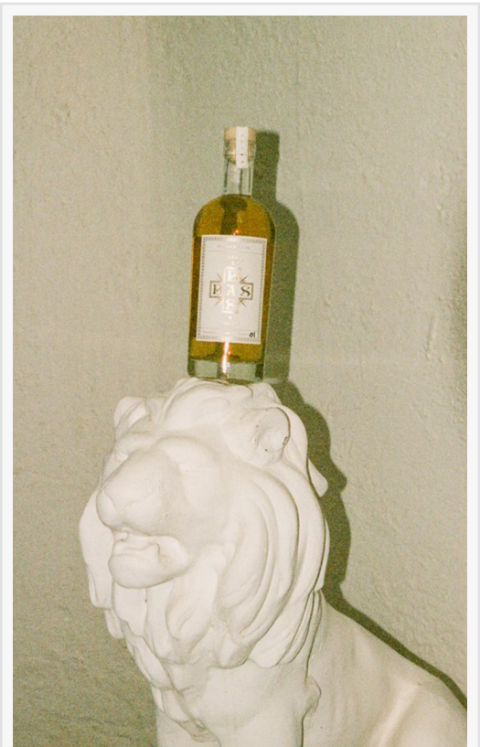
Basbas Premium Hierbas on a Lion Head