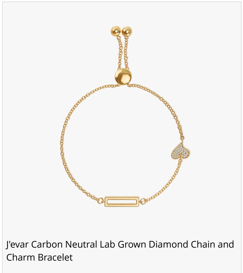
J'ever Carbon Neutral Lab Grown Diamond Chain and Charm Bracelet