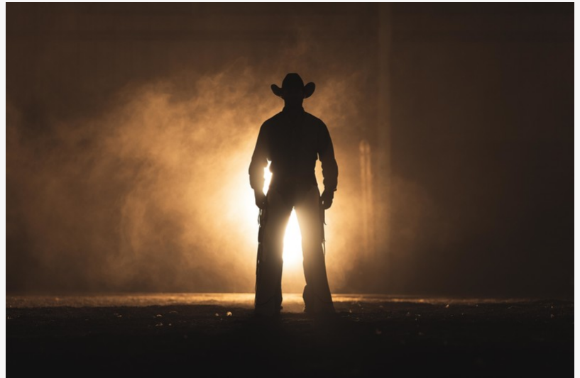
Scene2 from 'Unbroken'