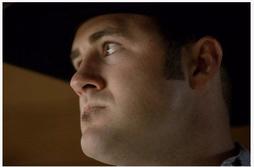
Scene3 from 'Unbroken'

This press release can be viewed online at: https://www.einpresswire.com/article/631323114 EIN Presswire's priority is source transparency. We do not allow opaque clients, and our editors try to be careful about weeding out false and misleading content. As a user, if you see something we have missed, please do bring it to our attention. Your help is welcome. EIN Presswire, Everyone's Internet News Presswire™, tries to define some of the boundaries that are reasonable in today's world. Please see our Editorial Guidelines for more information. © 1995-2023 Newsmatics Inc. All Right Reserved.