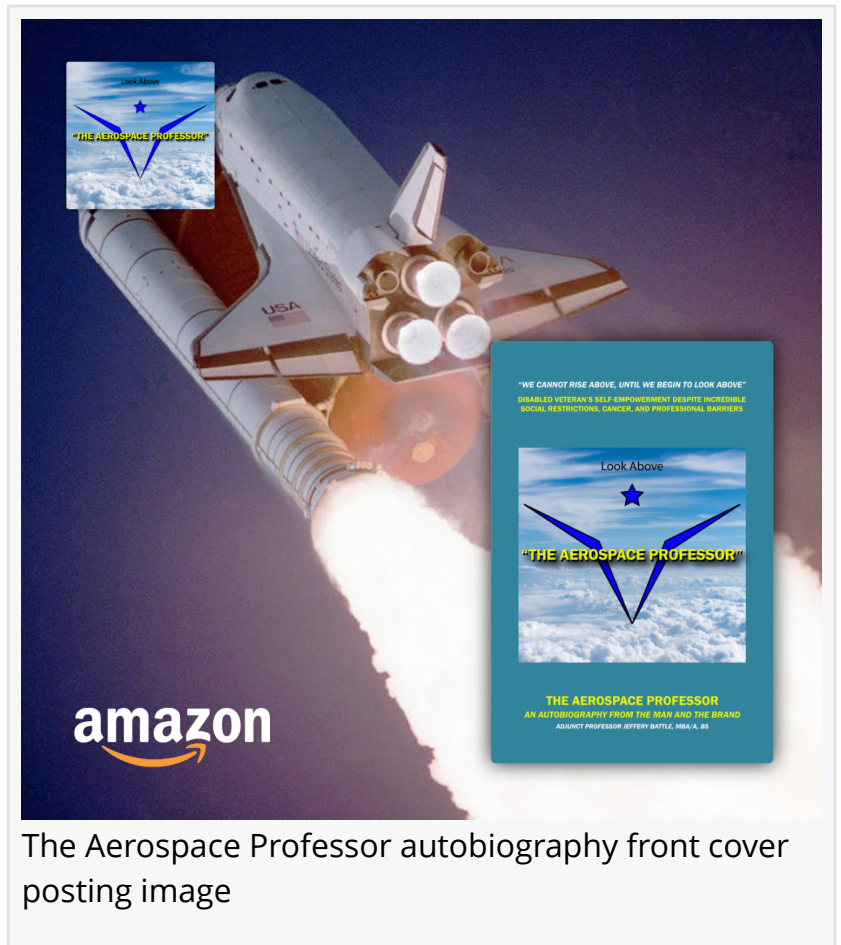
The Aerospace Professor autobiography front cover posting image

This press release can be viewed online at: https://www.einpresswire.com/article/631324518 EIN Presswire's priority is source transparency. We do not allow opaque clients, and our editors try to be careful about weeding out false and misleading content. As a user, if you see something we have missed, please do bring it to our attention. Your help is welcome. EIN Presswire, Everyone's Internet News Presswire™, tries to define some of the boundaries that are reasonable in today's world. Please see our Editorial Guidelines for more information. © 1995-2023 Newsmatics Inc. All Right Reserved.