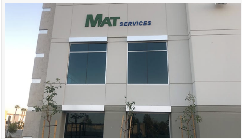
MAT Recyclers Headquarters - Ontario, CA

closing the gap between the number of mattresses that are recycled and the number that are