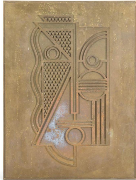
Brass plaque by Roy Lichtenstein (American 1923-1997), titled Modern Head Relief (1970), with an etched signature and edition number of "70/100" ($14,250).

Next up for Ahlers & Ogletree is a three-day Fine Estates & Collections auction planned for June 15th-17th, online and live in the new gallery on Atlanta's Upper West Side, at 1788 Ellsworth Industrial Boulevard, near The Works. For more info, visit www.AandOAuctions.com .