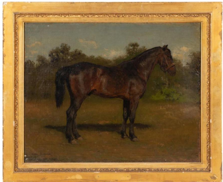
Oil on canvas Study of a Brown Bay Horse by Rosa Marie Bonheur (French, 1822-1899), a landscape painting depicting a standing chestnut brown bay horse with trees ($15,730).