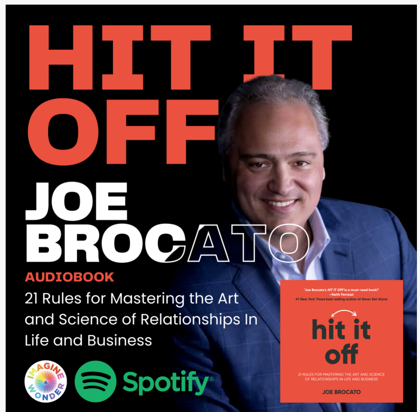
Also available as an audiobook