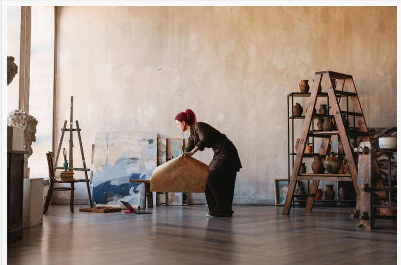
young woman painter in an art studio

Avi-Meir points out that this emotional investment can be especially taxing for artists, who often pour their hearts and souls into their work only to face rejection and criticism. "Artists put themselves out there in a way that few others do. They're vulnerable and exposed, and it can be incredibly difficult to deal with rejection or negative feedback," he says.