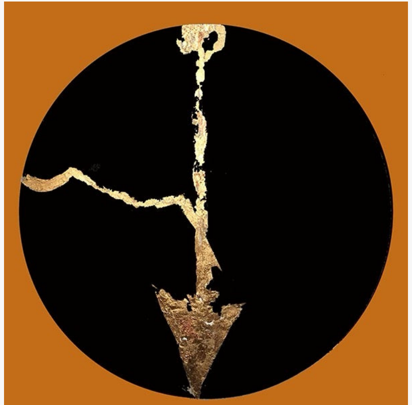
Arrow Sutra Art