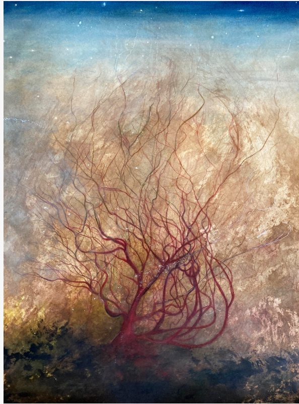
Eros Burning Into Darkness