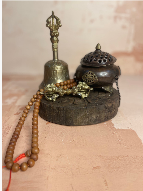
Organic Erotic Monastery Kit

Each customer works with a certified Organic Erotic Guide who walks them through the whole process via video conferences and text messages. Organic Erotic is built on the ethos that an individual's environment, her home, must first feel good. When home spaces feel good, the consumer feels good. Organic Erotic curates, designs, and ships a box filled with items picked just for the customer. The aim is that a space that is cleared of the clutter, has less and can then begin to be filled with items that are purposeful and meaningful to an individual and their families.