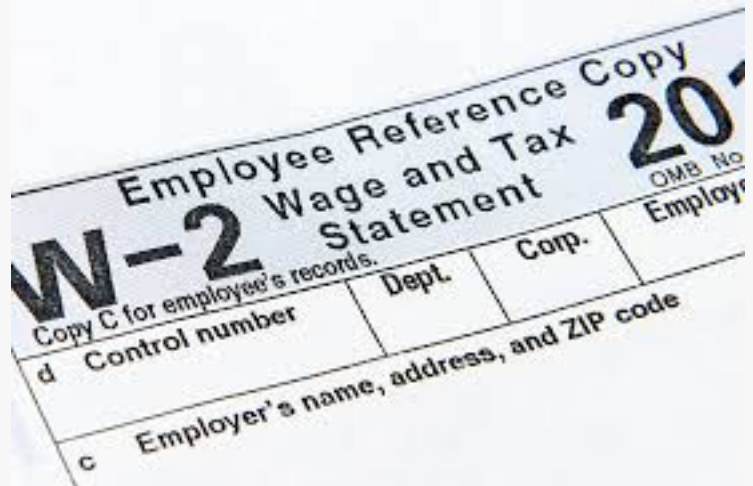
Lost your W-2 form