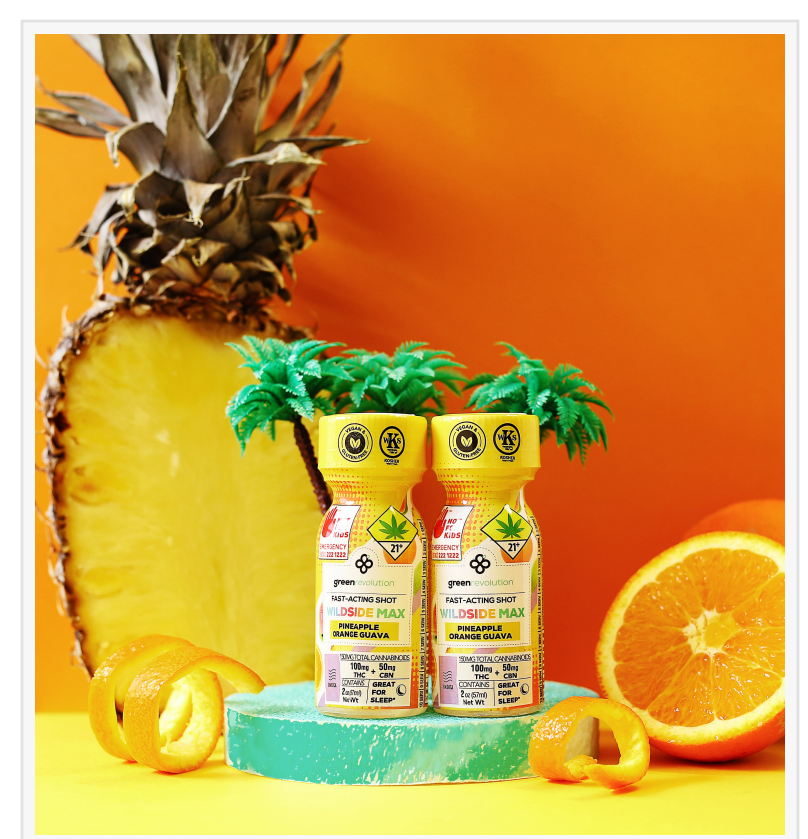
WIldside Max Pineapple Orange Guava 50mg CBN Cannabis Shot 2:1 THC:CBN (100mg THC: 100mg CBN)

Unlike the competition, which is only able to add a small amount of minor cannabinoids to their THC shots, Green Revolution has achieved a technical