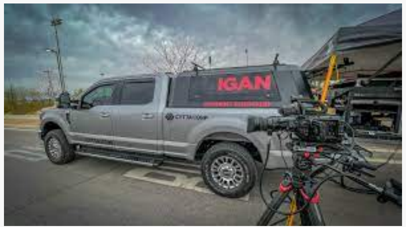
$CYCA IGAN Technology

The combination of Megh's VAS capability with CYCA IGAN software engine, provides first responders, law enforcement and all security services with a myriad of benefits, including improved situational awareness and better decision-making in emergency situations. Thanks to AI-powered algorithms, VAS can analyze vast amounts of data from multiple sources, such as surveillance cameras, drones, and other sensors. These features combined with the IGAN engine will provide real-time insights that allow crisis teams to respond proactively.