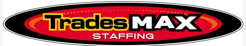
Employment Agency in Knoxville Logo

KNOXVILLE, TN, USA, May 3, 2023 /EINPresswire.com/ -- The top agencies to find jobs hiring in Knoxville , TradesMax Staffing - Knoxville, released a white paper on the benefits of proper lifting techniques. Back injuries are responsible for one in five workplace injuries. Proper lifting techniques are essential for avoiding the painful and disabling injuries associated with poor lifting techniques. In the white paper that TradesMax Staffing released, it gave some tips on to lift correctly.