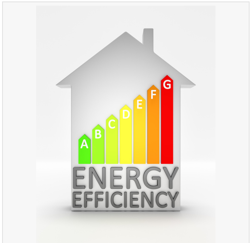
Residential Energy Tax Credit

Homeowners across the United States are now eligible for a hefty tax deduction when they purchase and install new windows. This exciting news comes from the Internal Revenue Service (IRS), which recently announced the availability of this new and