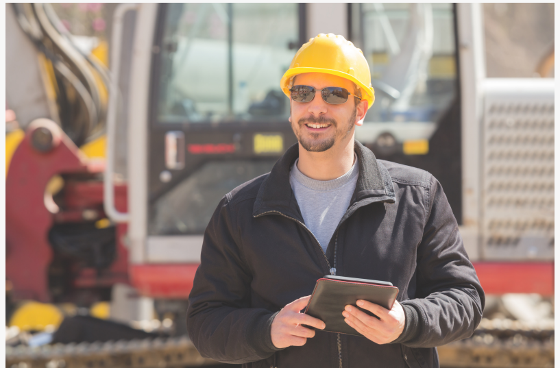
CrewTracks Unveils Production Tracking Features with Advanced Notifications

LAYTON, UT, USA, May 4, 2023 /EINPresswire.com/ -- CrewTracks , the top construction management software provider, has introduced a collection of novel features aimed at enhancing field management for construction teams. These features, encompassing production tracking and tailored notifications, are engineered to assist teams in maintaining control over their tasks and addressing issues promptly.