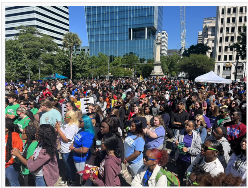
Approximately 1,700 seniors attended the rally at the South Carolina State House.

Mirrored after National Signing Day and organized by the South Carolina Commission on Higher Education, College and Career Decision Day provides an opportunity for the state to recognize and applaud students