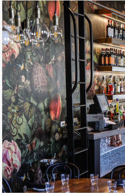
Custom wallpapering titled "The Tree of Life," made in collaboration with local West Town business, Urban Source.