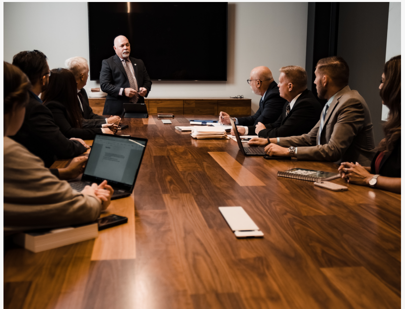
Blackfish Intelligence Team

This press release can be viewed online at: https://www.einpresswire.com/article/631642134 EIN Presswire's priority is source transparency. We do not allow opaque clients, and our editors try to be careful about weeding out false and misleading content. As a user, if you see something we have missed, please do bring it to our attention. Your help is welcome. EIN Presswire,