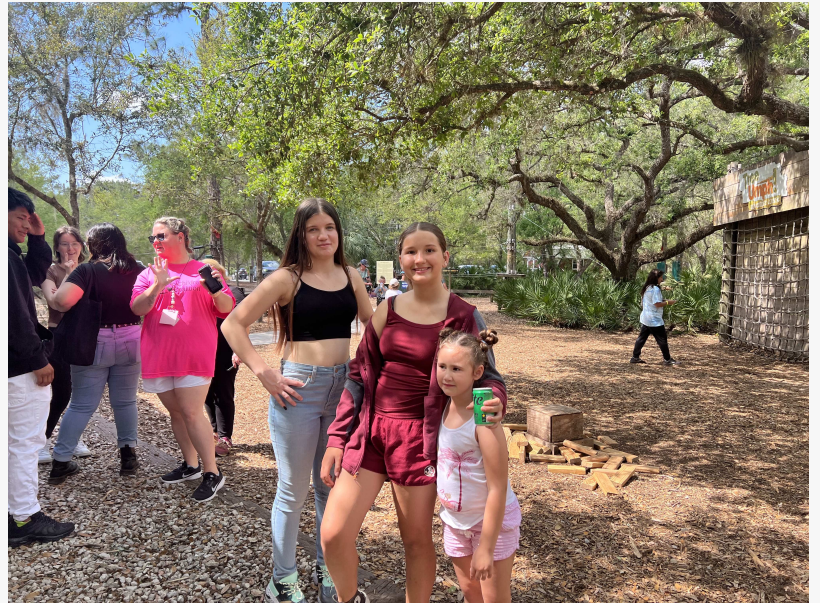
Children climbing and having fun