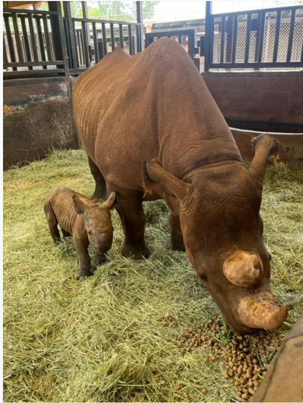
Newborn Rhino at Honolulu Zoo