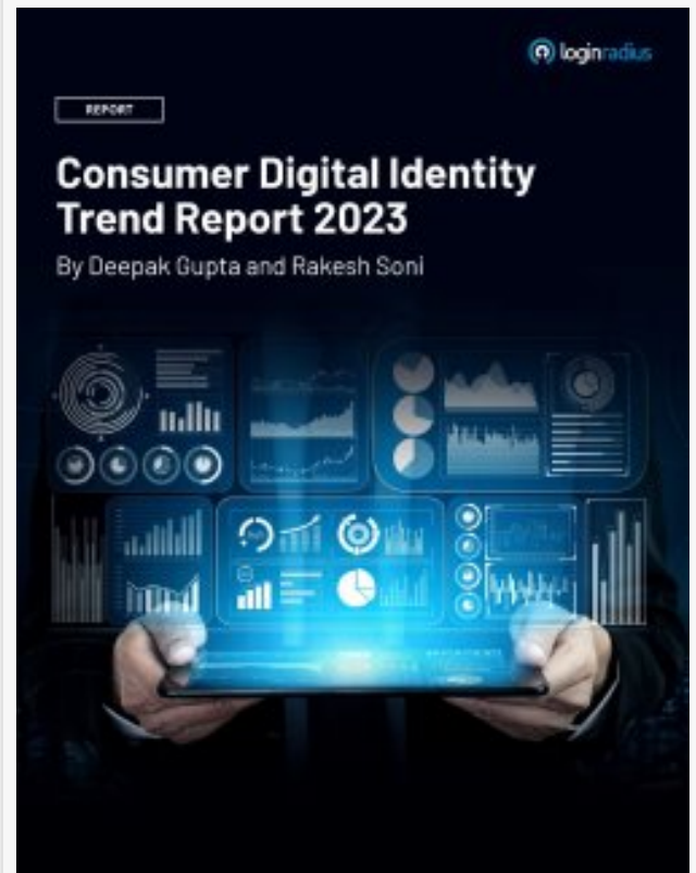
Cover page of the report