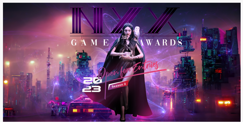
2023 NYX Game Awards Season 2 Call for Entries

spokesperson of IAA. "We believe that games have the ability to change lives, and our panel of jurors is always ready to recognize talented developers and creators."