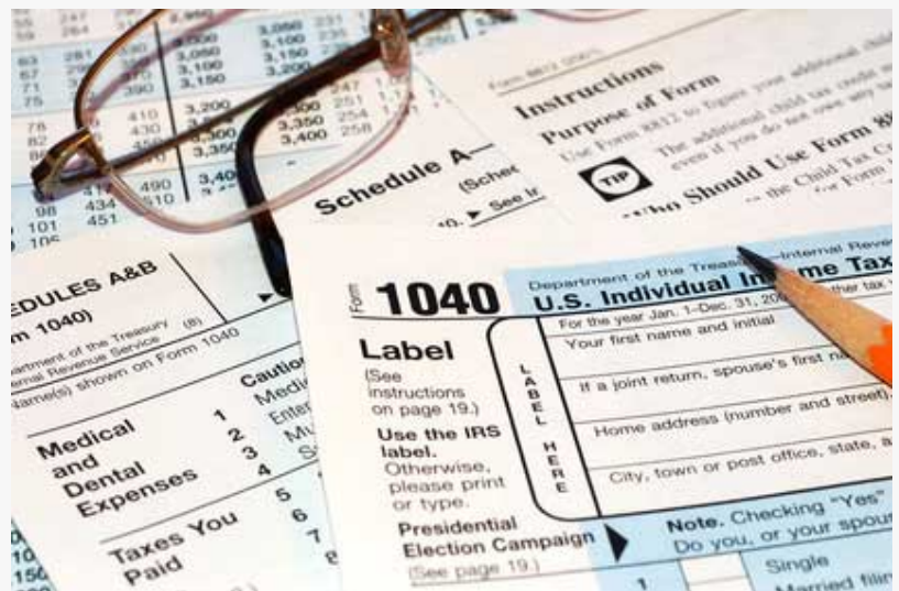
Filing Your 1040 Tax Form