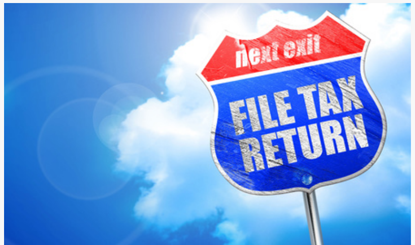
Tax Filing Start Date

The IRS has also stated that they anticipate providing refunds to taxpayers faster than ever before, with most refunds expected to issue within 21 days after the return is accepted.