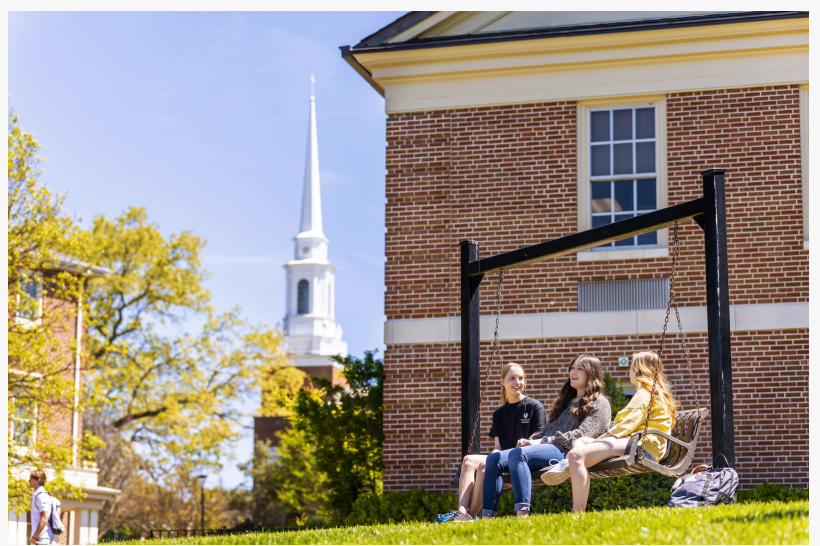
GWU Ranks No. 1 in Campus Safety