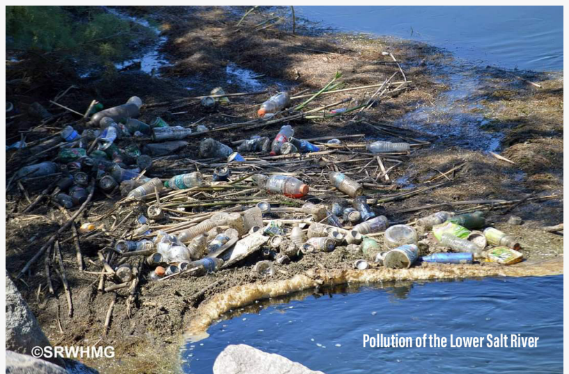
Pollution on the Lower Salt River