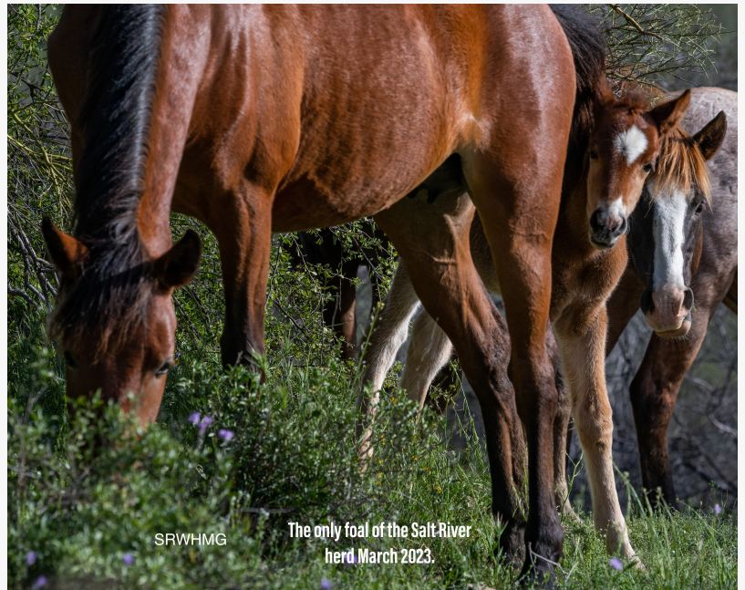
The only foal of the Salt River herd-March 2023

The public is outraged that the horses are being blamed by this lawsuit. (case number CV 23-715-PHX JAT filed in the United States District Court for the District of Arizona, Phoenix Division.) It seeks to halt the groundbreaking humane wild horse management programs.