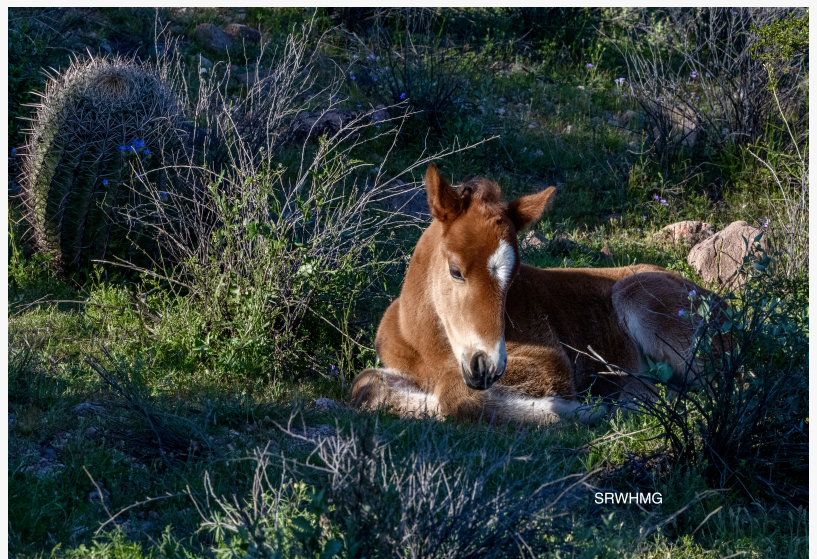
Splendor, 2023's only foal, lying in grass.