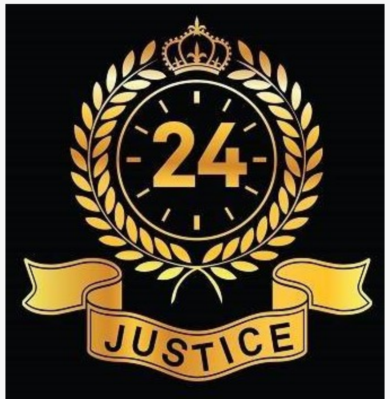
Company Logo for 24Justice.pk

The shift towards online marriage has been driven by several factors. One of the primary reasons is the rising cost of weddings. Weddings have become a huge expense, and the