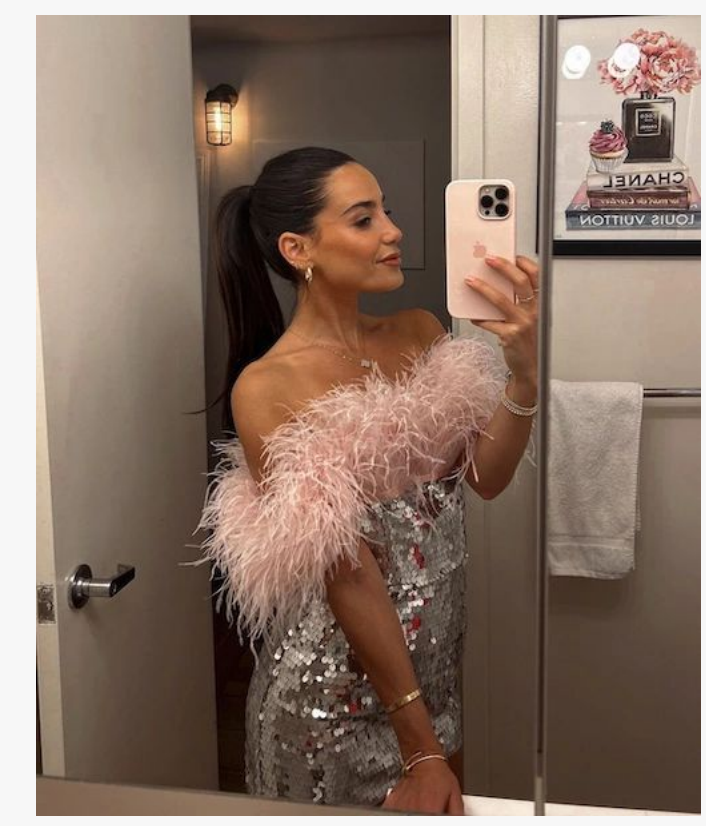
doll eyelash extensions