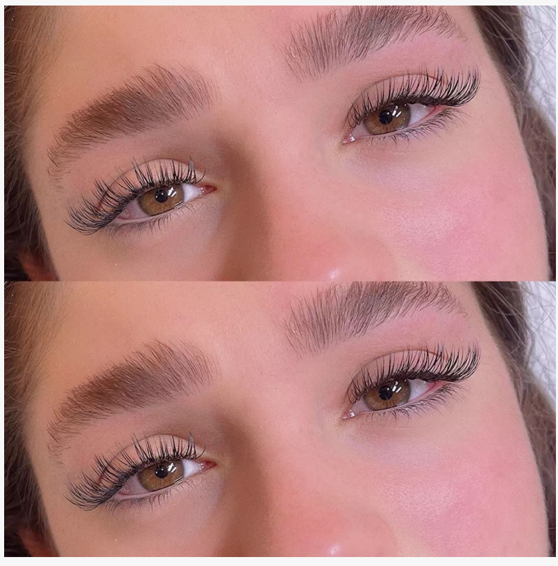
eyelash extensions Melbourne

For more information about the salon and their services, please visit their website at