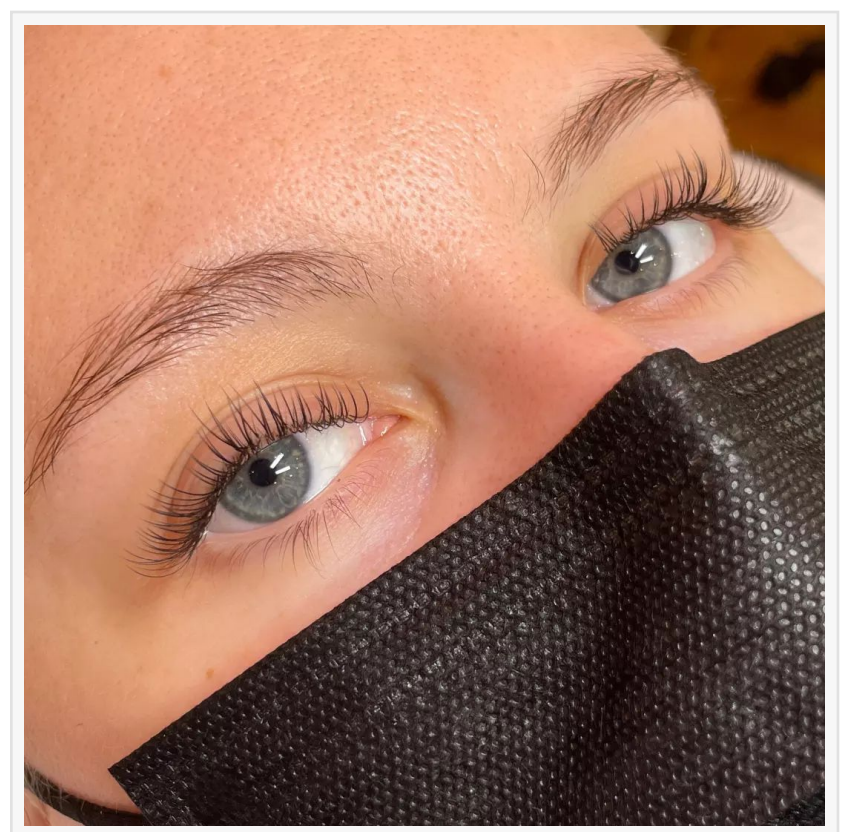
classic eyelash extensions

Velvet Lashes Velvet Lashes and Beauty +61 411 036 817 info@velvetlashesandbeauty.com.au Visit us on social media: Facebook Instagram