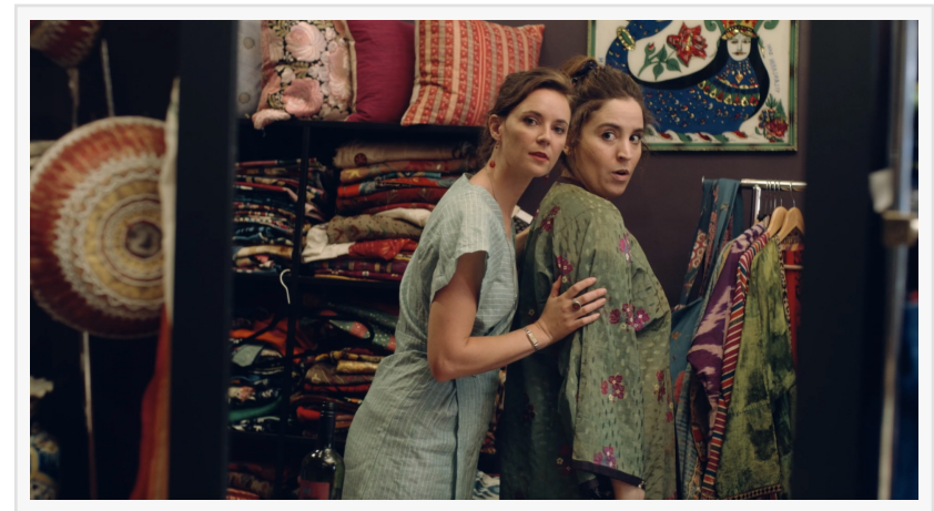
Scene from THE SISTERS KARRAS