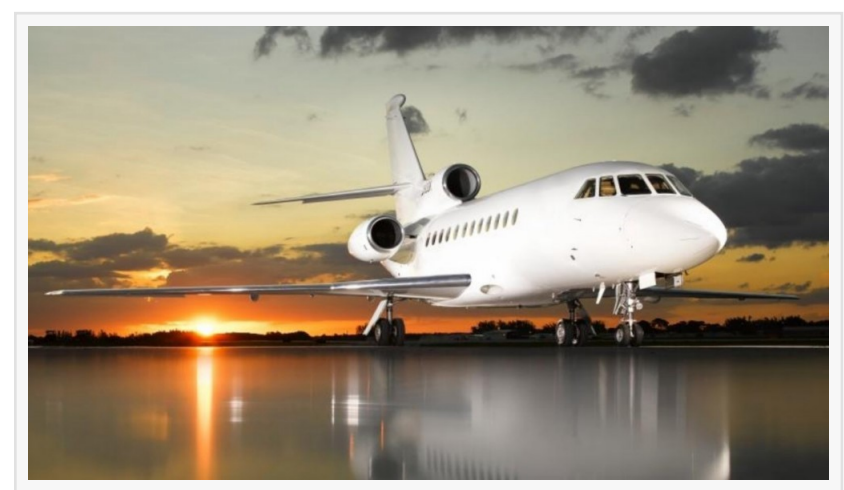
Dassault Falcon 900EX listed exclusively by JetHQ, Kansas City, Mo., on IADA's marketing portal AircraftExchange and scheduled to be on display at EBACE.

In total, 41 key dealers and IADA products and services members will be participating at EBACE, either with their own exhibits or co-exhibiting with IADA at the dealer association's booth,