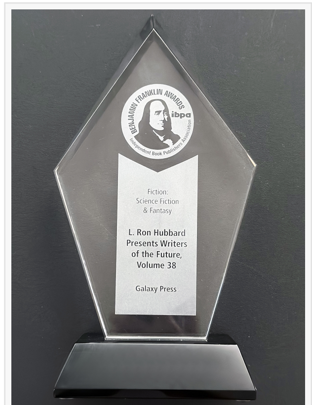
L. Ron Hubbard Presents Writers of the Future Volume 38 Benjamin Franklin Award for Fiction: Science Fiction and Fantasy

“Teamwork: Getting the Best out of Two Writers” by Brian Herbert and Kevin J. Anderson