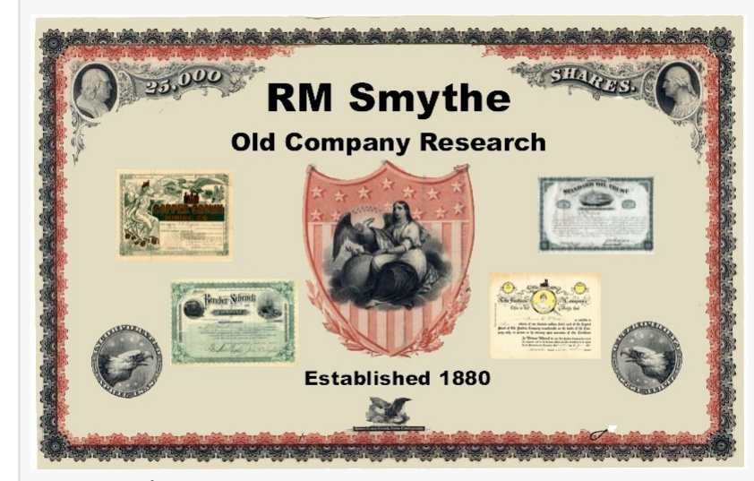
RM Smythe Since 1880

conclusion by Bell. <a href="https://scripophily.net/alexander-graham-bell-signed-letter/">https://scripophily.net/alexander-graham-bell-signed-letter/</a>