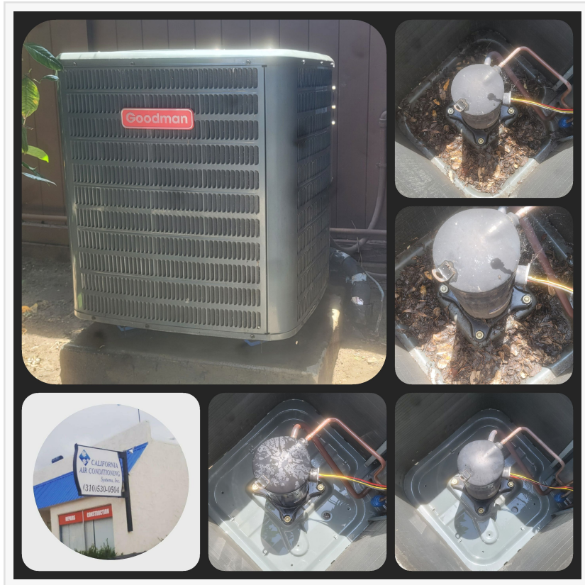
California Air Conditioning Lomita, CA

Aside of expanding there Air Conditioning services, now they can offer plumbing to keep there customers happy. The company under stands customer services and helping there customer with 24 hour customer