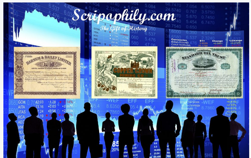
Scripophily.com is the Gift of History