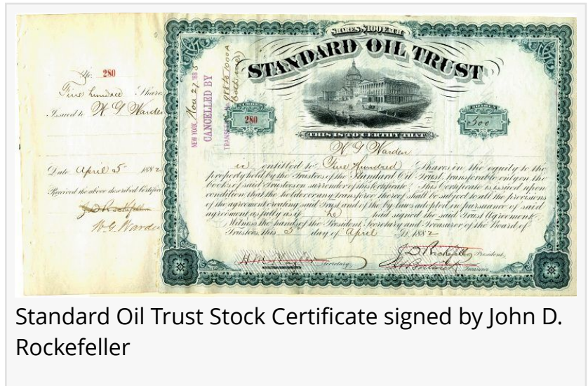
Standard Oil Trust Stock Certificate signed by John D. Rockefeller

Scripophily.com, the world's number one buyer and seller of collectible stock and bond certificates, is proud to announce the addition of new certificates to its website. The new certificates include a variety of stocks and bonds from companies around the world, including the United States, Canada, Mexico, Australia, Europe, and Asia. These certificates represent a variety of industries, including banking, energy, transportation, and manufacturing.