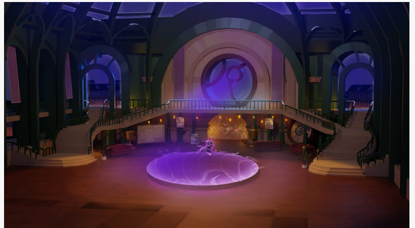
Maximize the talent's of your Dogamí with training.