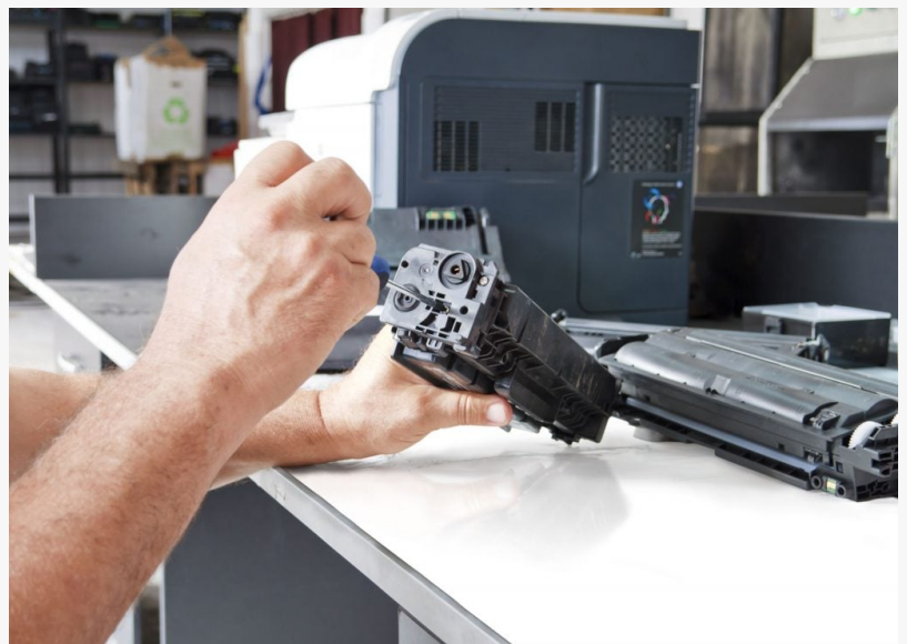
Good Printer Cartridges

Delivery of the products is done super quickly by the company. The products are delivered within 2 to 3 working days by the company under their priority service. As a result of this, clients can receive their orders for the products quite promptly. Customers should expect their orders to arrive for non-priority services in three to seven business days.