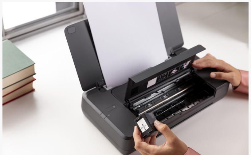
Great Toner Cartridge