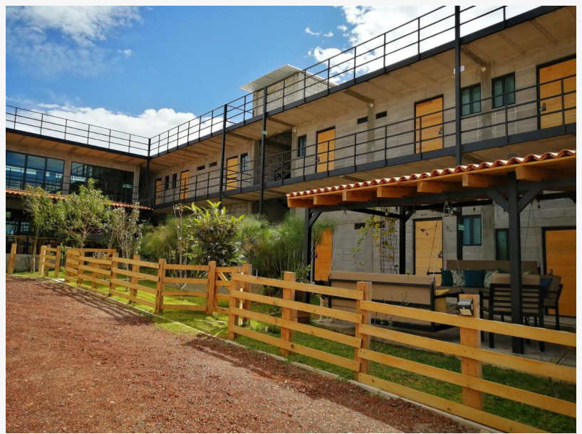
Casa Antares by Quartz Inn Hotels

Casa Antares Hotel, now renamed Casa Antares by Quartz Inn Hotels, is located in close proximity to Queretaro Airport, surrounded by nature, and features 15 rooms. The hotel has already implemented various sustainable initiatives, including the use of biodegradable cleaning products, the reuse of greywater, rainwater harvesting, and solar water heaters.