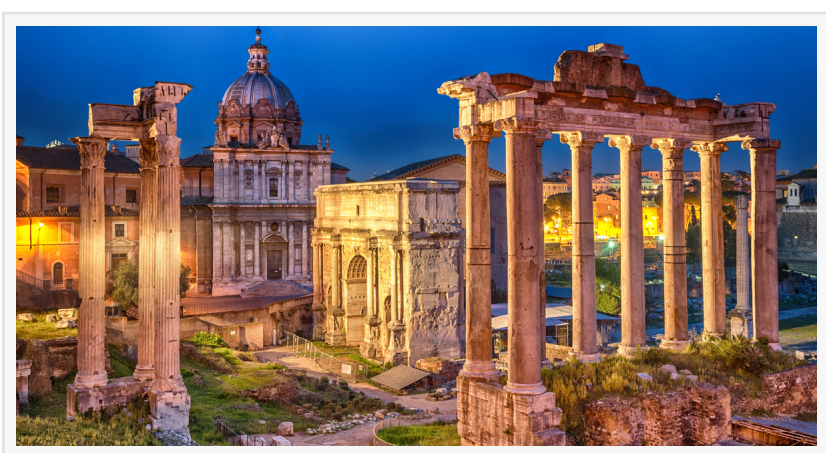
Everybody should visit Rome at least once.

PHILADELPHIA, UNITED STATES OF AMERICA, May 8, 2023 /EINPresswire.com/ -- <u>The American</u> <u>University of Rome</u> is offering an indepth educational tour & study program in <u>Rome</u> designed for participants of any age & experience. This unique program offers a perfect