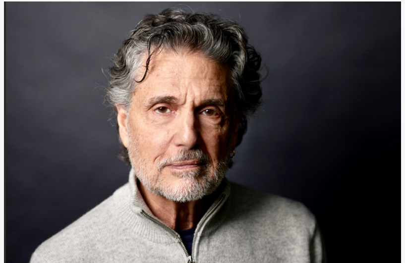
Chris Sarandon.

FAIRFIELD, CT, US, May 8, 2023 /EINPresswire.com/ -- Oscar®-nominee Chris Sarandon's popular ' Cooking By Heart ' podcast is, as ranked by Listen Notes, already among the top 5% of all podcasts globally- and Chris' next live event will be with the renowned actress (and Chris' first wife) Susan Sarandon at Sacred Heart University Community Theatre in downtown Fairfield on Thursday, May 25th at 7 PM.