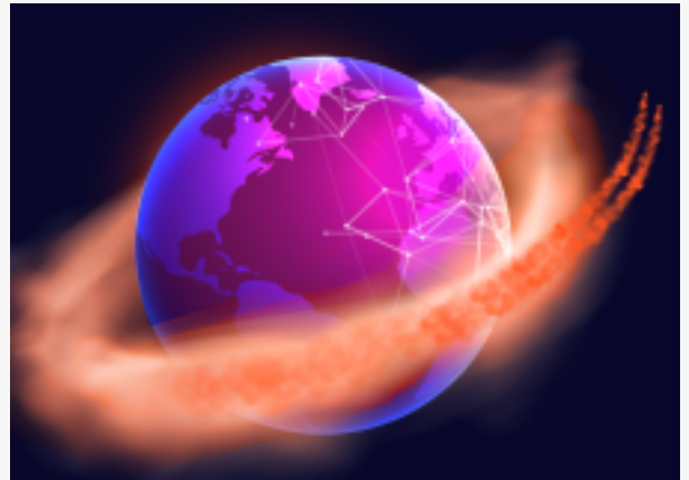
MyLand Earth Metaverse Launched the First in the Market 3D Earth Metaverse on Web3 Blockchain, allowing individual users and enterprises to setup their Metaverse presence quickly

The platform-based 3D scene templates of art galleries, expo showrooms, retail stores, and 3D