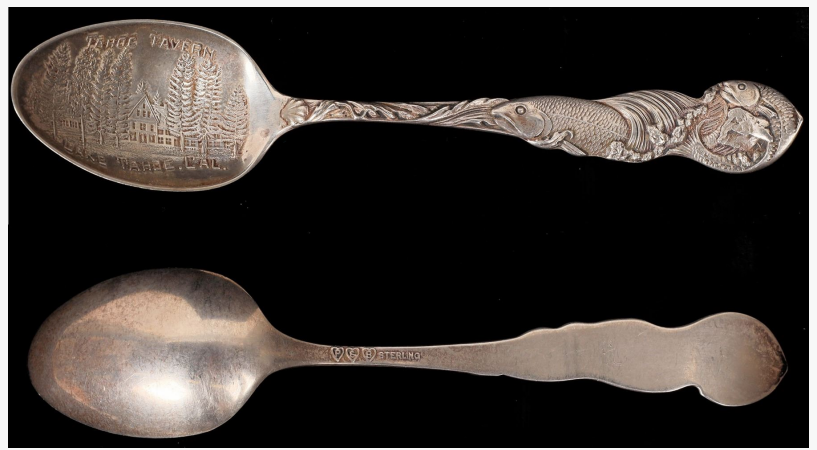
Tahoe Tavern sterling souvenir spoon with a fish handle and engraved bowl ("Tahoe Tavern" and Lake Tahoe, Calif."), sold in the Tahoe Tavern gift shop circa 1906-1910 (est. $150-$300).