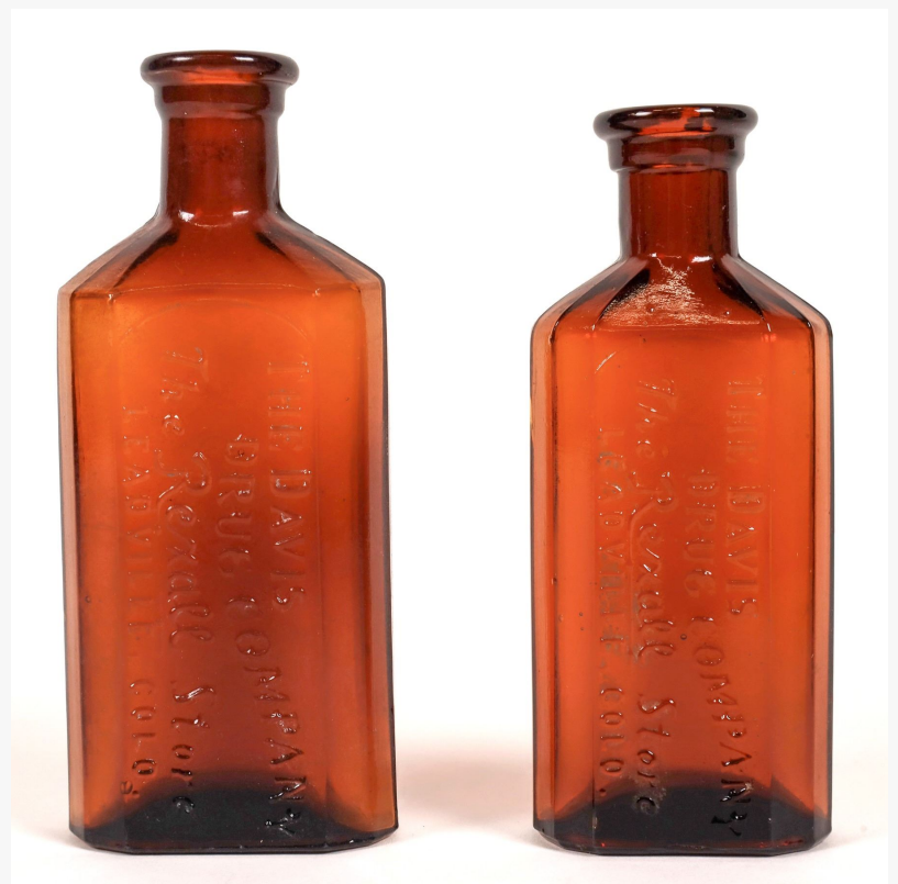
One lot of two amber drug bottles from Leadville, Colorado (The Davis Drug Company and The Rexall Store), circa 1900, both bottles clean with no chips (est. $200-$400).