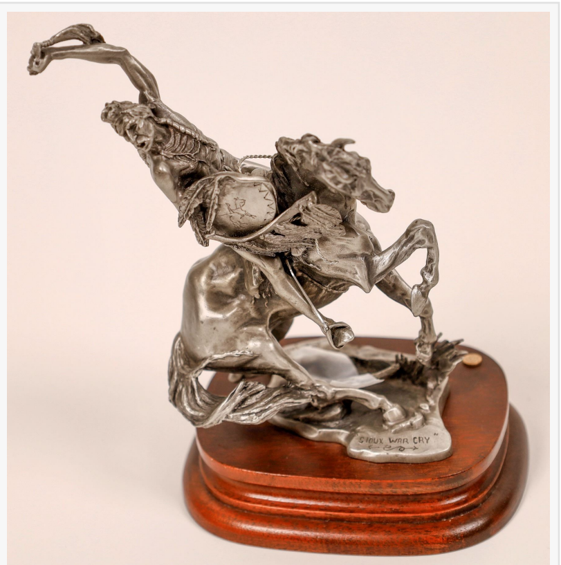
Michael Boyett pewter sculpture titled Sioux War Cry, from the Chilmark Legacy of Courage Collection honoring the American Indian, 4 ½ inches tall on a wooden base (est. $90-$150).

Day 2, on Sunday, May 14th, will be packed with 715 lots of Native Americana, cowboy collectibles, transportation (air, automobile, railroad), mining, stocks and bonds (mining, railroad, miscellaneous), bottles, and numismatics (currency/scrip, coins, medals and tokens).