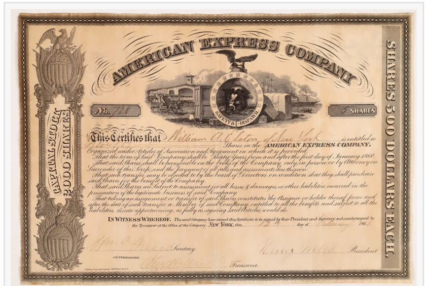
1861 American Express Company stock certificate signed by Henry Wells and William G. Fargo (co-founders of American Express and founders of Wells Fargo & Company (est. $500-$1,000).

RENO, NV, UNITED STATES, May 9, 2023 /EINPresswire.com/ -- An American Express Company stock certificate from 1861 signed by Henry Wells and William G. Fargo (two of the three founders of American Express and the founders of Wells Fargo & Company) is an expected highlight in a special two-day timed auction event titled "Spring into Americana" slated for May 13th & 14th by Holabird Western Americana Collections.