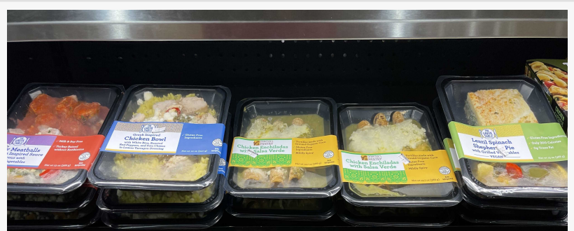
Demeter's Pantry meals at Harris Teeter stores

/EINPresswire.com/ -- Demeter's Pantry, a Maryland, woman owned company, partnered with Harris Teeter to offer its line of Latin and Mediterranean Meals in the deli, grab&go area. Made with real, natural ingredients, the meals taste and look homemade and are conveniently ready to heat and enjoy. Demeter's Pantry offers a variety of three hand rolled Enchiladas with salsa verde and salsa roja and a line of Mediterranean meals under its own brand "The Greek Table".