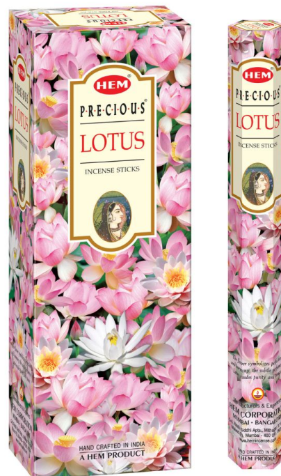
HEM Precious Lotus Incense sticks

The HEM Gardenia, Lavender, Jasmine, Lotus & Tangerine Incense sticks are available on