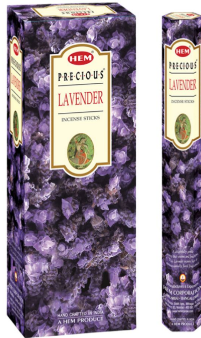
HEM Precious Lavender Incense Sticks

HEM, has launched an extensive range of fragrances to cater to diverse preferences, featuring sweet and floral scents as well as bright and tangy aromas - experience the magic of spring in any space with HEM's premium incense sticks today.