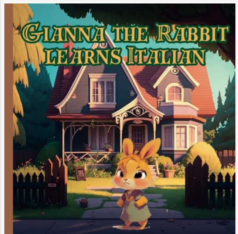
New Amazon title for children to learn Italian.

Both books focus on the 4-to-8 year old market. The colorfully illustrated titles, Gianna the Rabbit learns Italian and Giada Learns Italian are available at Amazon.com.